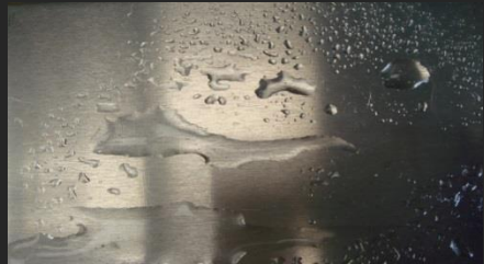
Roughly frosted surface

Spray water over a small area and check that the water spreads evenly. No droplets should appear .