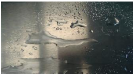
Roughly frosted surface